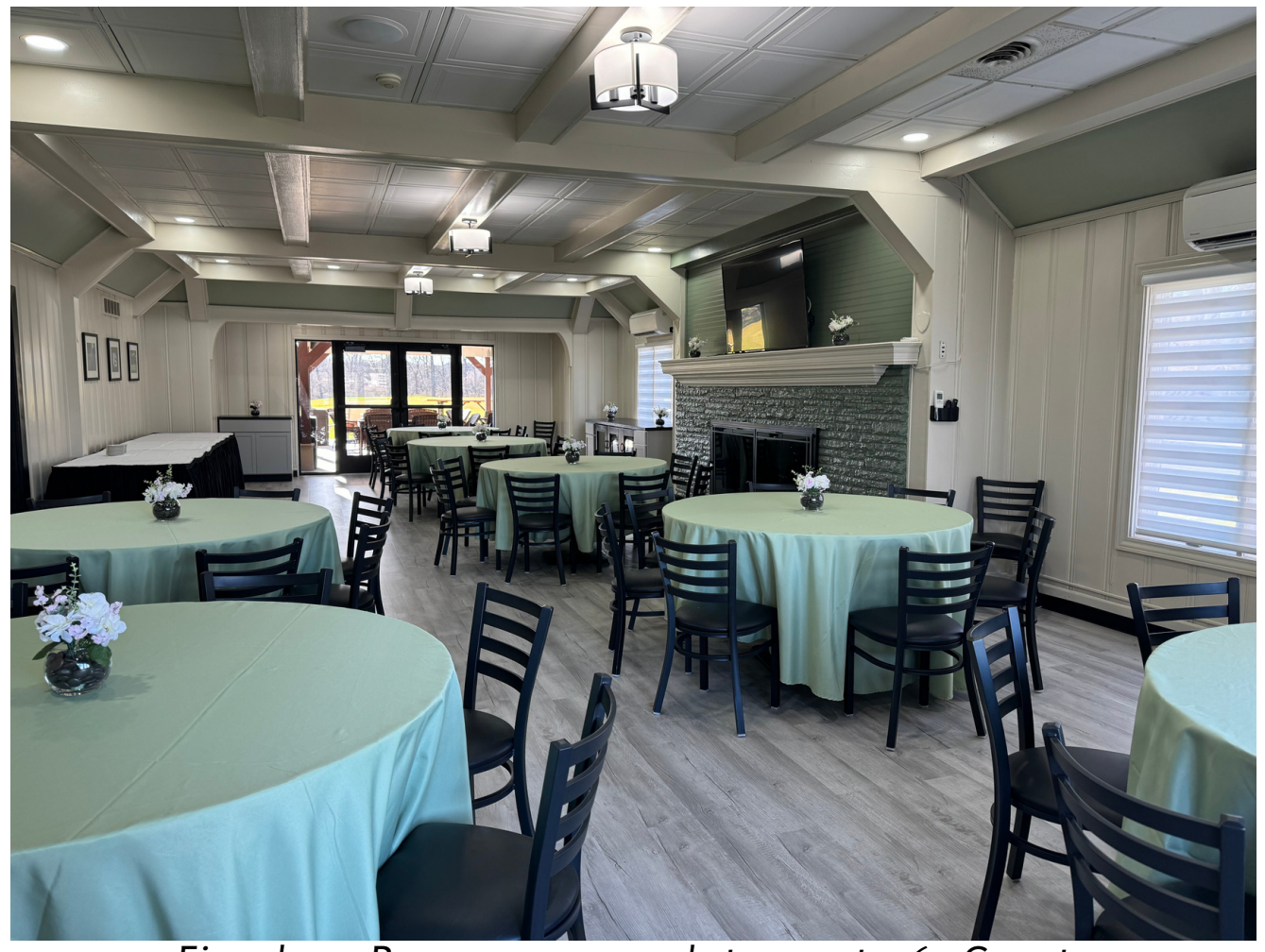
Fireplace Room accommodates up to 65 Guests